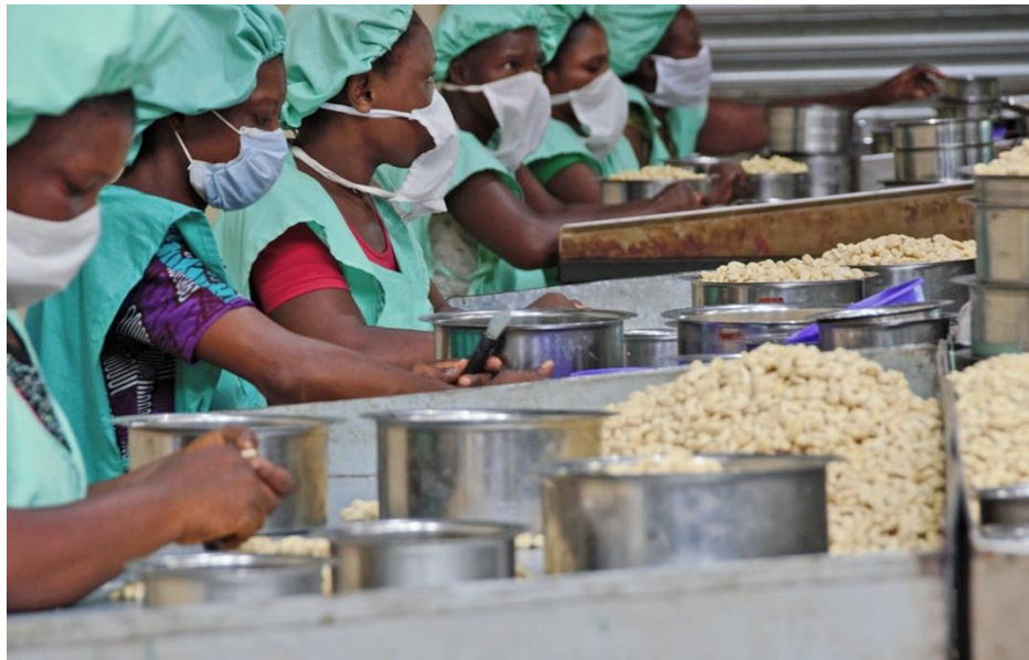
Global Cashew Harvest / West Africa Processing Share