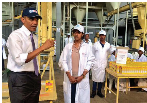
President Obama Tours TechnoServe Project in Ethiopia.