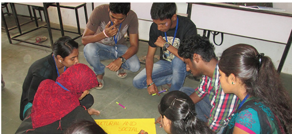
Mumbai youth receive training to help identify strengths and set realistic goals.

A partnership between TechnoServe and J. P. Morgan India, YEP increases access to skills, training and employment opportunities for youth living in Mumbai. Targeting disadvantaged youth aged 18-25, YEP has already made its mark in the region — especially the young female population.