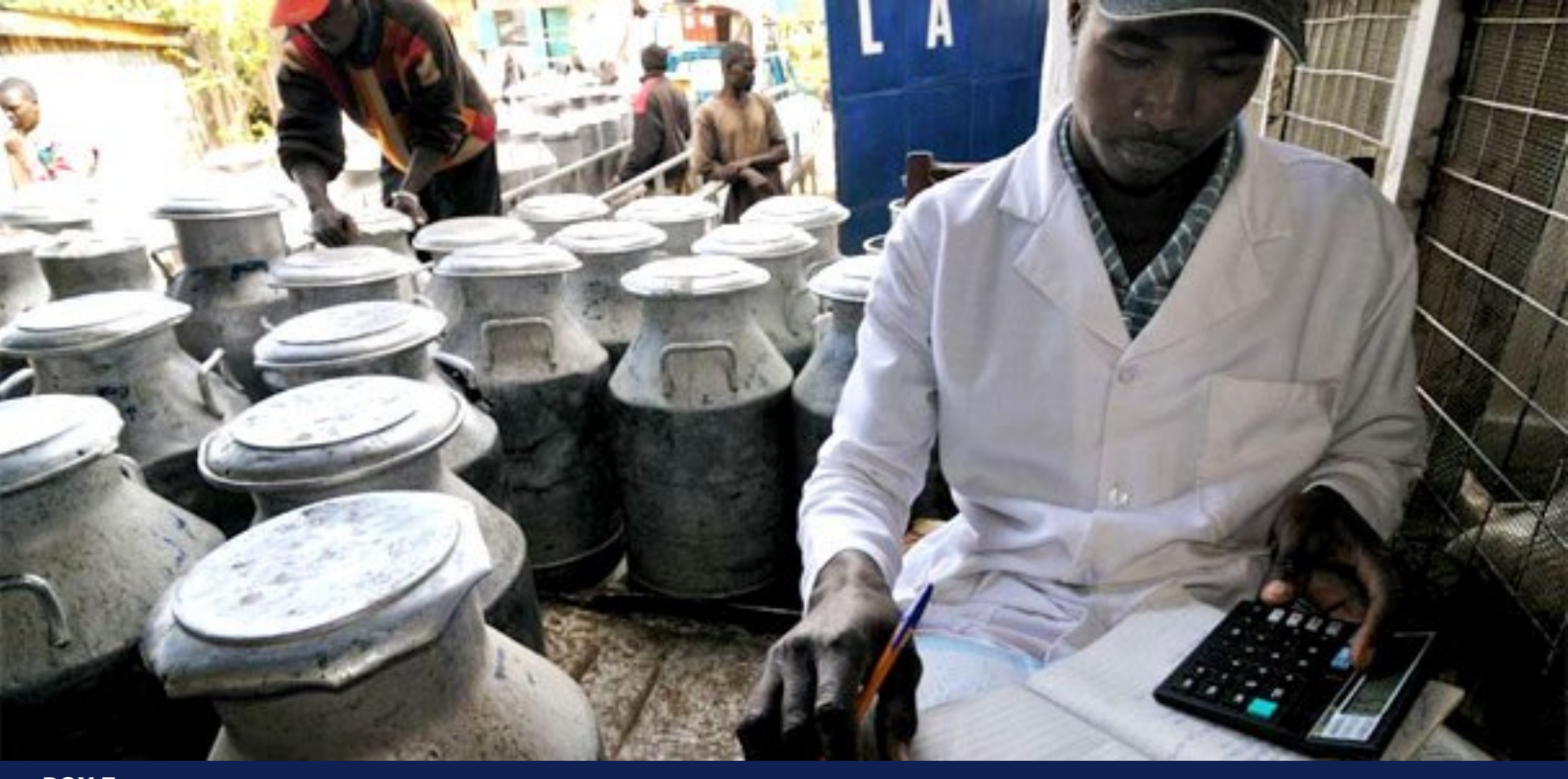
BOX 7 EADD: Integrating Savings and Lending into Rural Milk Collection Hubs

Funded by the Bill & Melinda Gates Foundation and implemented through a partnership between TechnoServe and Heifer International, the East Africa Dairy Development (EADD) program aims to strengthen the overall dairy sub-sector and double the dairy-related incomes of 179,000 smallholder farming families in Kenya, Uganda and Rwanda. The program is reaching this goal by improving livestock health to increase milk production, organizing farmers into business collectives and expanding market access.