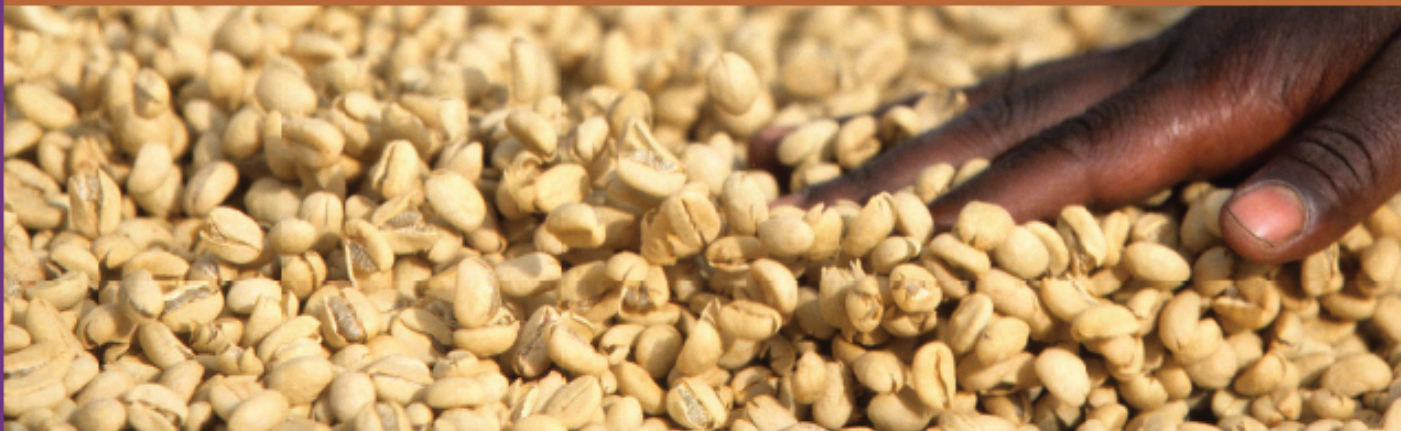
FIGURE 2: CROP SUITABILITY FOR OUTGROWER PRODUCTION.