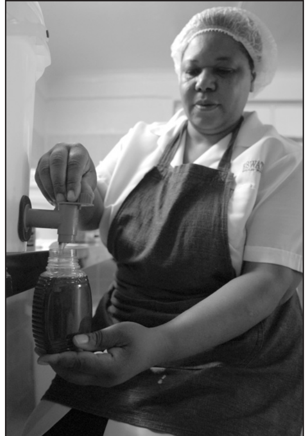
An Eswatini Kitchen employee bottles honey purchased from rural beekeepers.

Eswatini Kitchen Honey now buys honey from more than 200 beekeepers annually, and the business continues to work with TechnoServe to train more rural beekeepers. With TechnoServe's assistance, Eswatini Kitchen Honey processed more than 14 tons of honey in 2009, up from about eight tons in 2008. This growth is moving Swaziland closer to becoming a premier honey source in southern Africa.