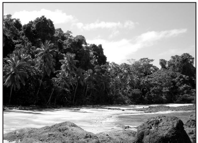
Mano Cambiada helps tourists enjoy the natural beauty of Colombia's Pacific coast.