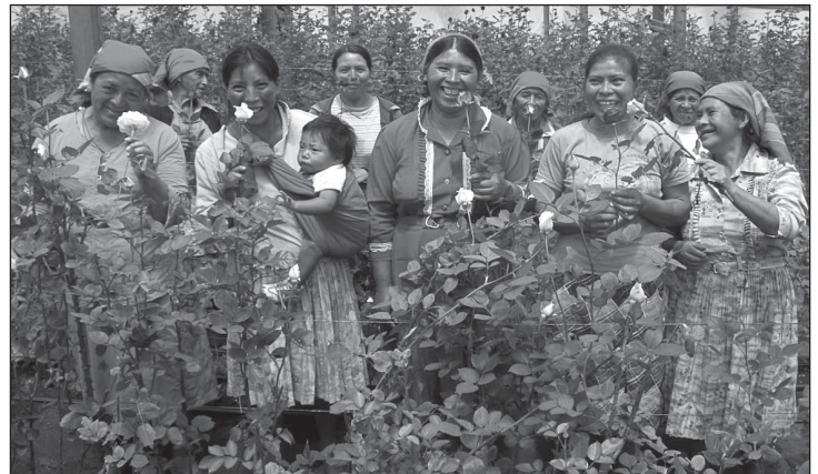
Your donations allow TechnoServe to assist businesses like the Floricultura El Clavel cooperative, a group of 12 women who cultivate and sell flowers in Intibucá, Honduras.