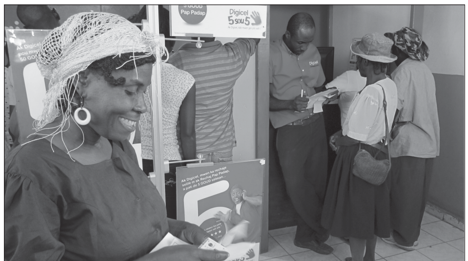
Farmers in Gros Morne, Haiti, receive loans as part of a TechnoServe pilot program.

TechnoServe and Sogesol launched a second round of loans in October for another 400 farmers. In the coming year, TechnoServe hopes to draw on lessons from the pilot and expand the program to even more Haitian farmers.