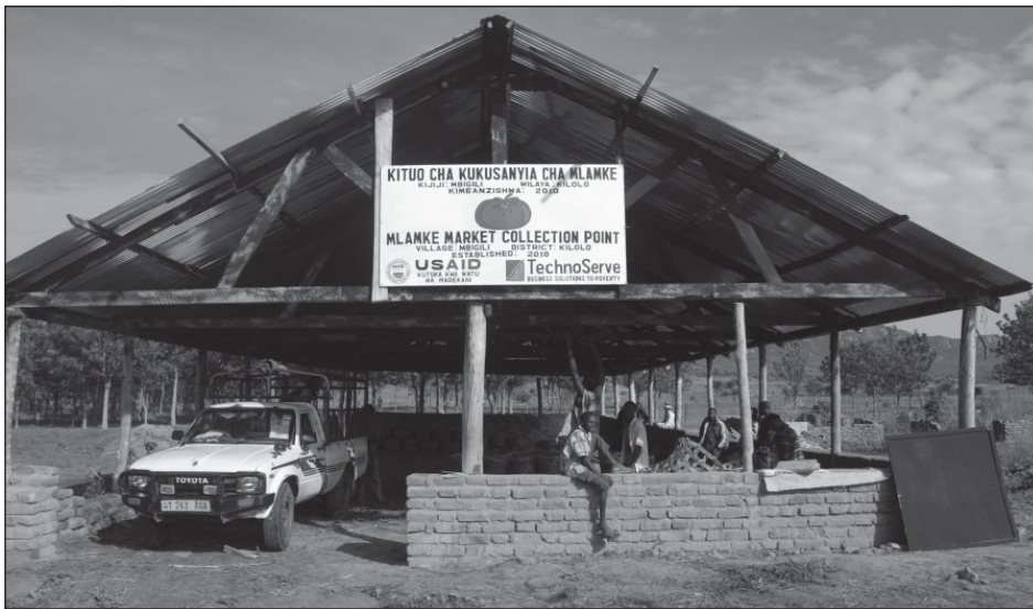
The Mlamke market collection point makes it easier for tomato farmers to connect to buyers.

one of the world's poorest countries. Our advisors are training these producers in best agricultural practices and helping them to form and strengthen business groups of 30 to 70 farmers. TechnoServe also is working with food processors, avocado exporters and tomato traders to enhance the efficiency of their operations and create demand for smallholder tomato and avocado growers.